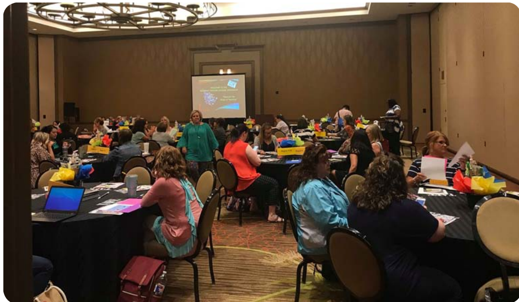
Teachers creating their make and take project at the teacher leader workshop this summer