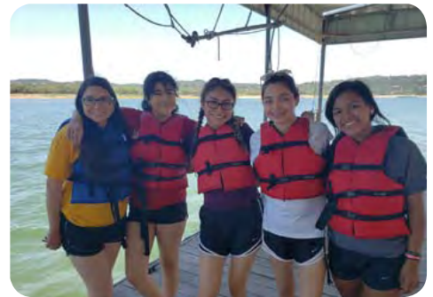
Some fun in the sun after leadership training.