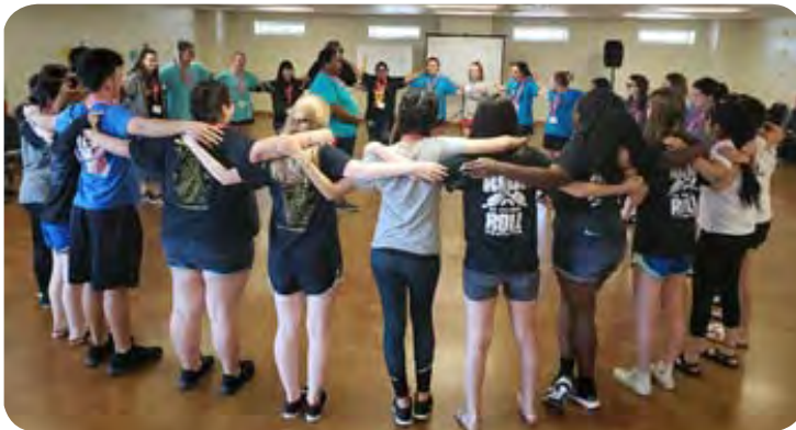
One of the team building games that helped bring the officers together as a whole group and as a TAFE family.