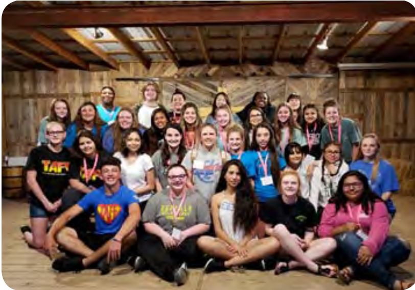
Region & State Officers at the campfire enjoying singing, dancing, s'mores and just getting to spend some time with each other.