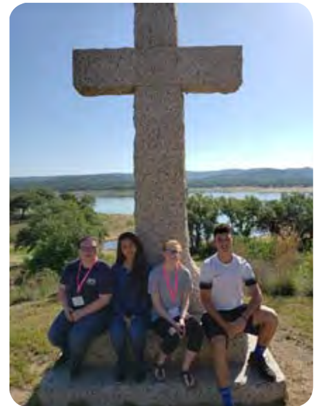
State Officers on the last day of the Region Officer camp. They are ready to have a spellbinding TAFE year.