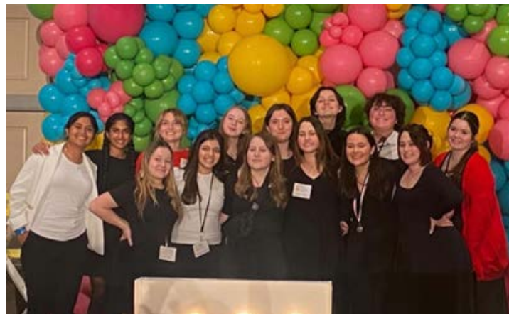
Kingwood High School