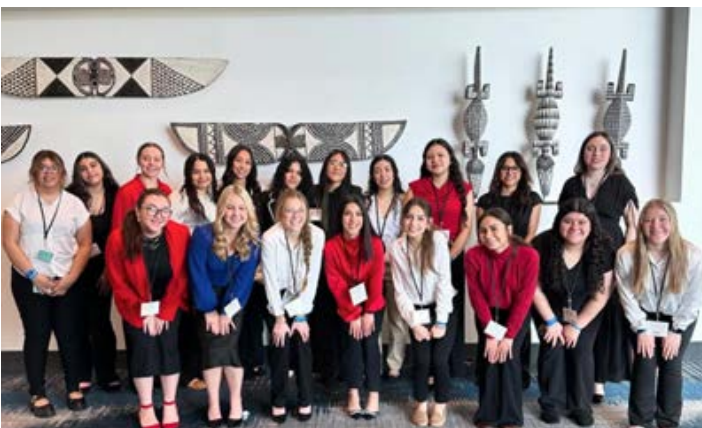
Dumas High School