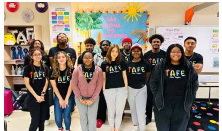
Alief Taylor High School