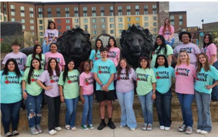
Lockhart High School