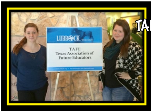
T.A.F.E students are ready to compete as they arrive in Lubbock, Texas.

I will be making a virtual TAFE scrapbook. I would like all of you to be represented in the scrapbook and would greatly encourage sending in pictures not only from the state conference but also from whatever your chapter may have done since then. Also, if you attend the FEA National Conference, please take pictures so we can put them in the upcoming May newsletter. Thank you and we hope to see your pictures. Please send pictures to kieans.ki@gmail.com .