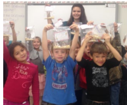
Teaching: Marcus High School TAFE students teach Holiday Lesson making reindeer food.