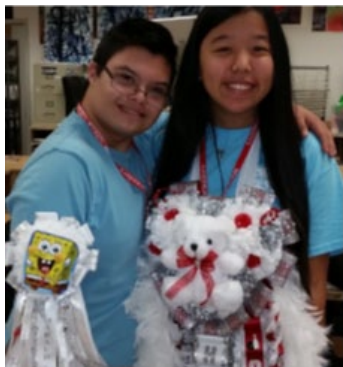
Service: Marcus High School TAFE members annually make mums and garters for Special Needs students.