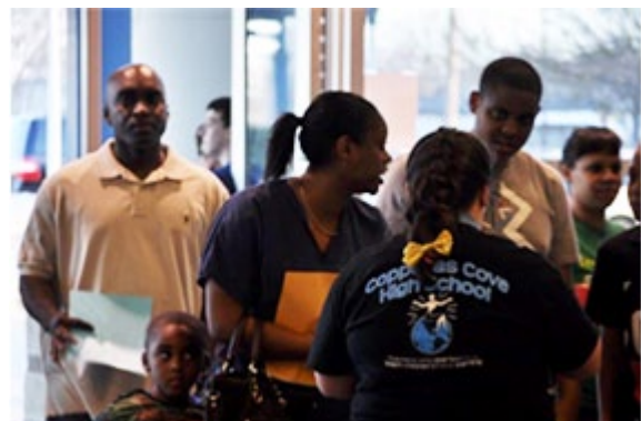
Education Awareness: Copperas Cove High School TAFE members showed incoming freshman around the high school and answered questions they might have had about high school experiences.