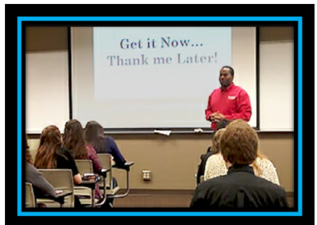
Learning new things is ALWAYS fun. Students are "Getting it Now" in one of many breakout sessions.