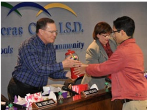
Appreciation: January is school board appreciation month, and Copperas Cove High School TAFE Officers presented our school board members with gumball machines.