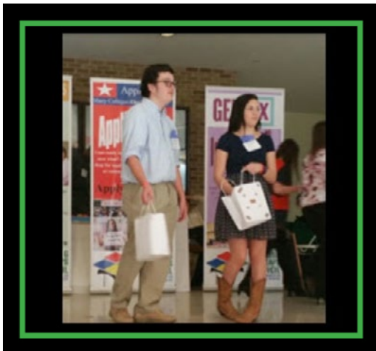
Bring in the Votes!