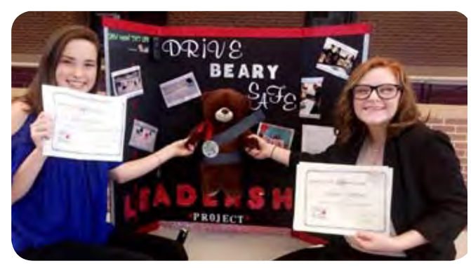
Leadership: Chapel Hill High School created a leadership project for teens to put down the phone and to promote safe driving.