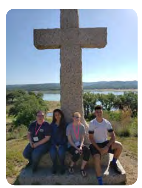
State Officers on the last day of the Region Officer camp. They are ready to have a spellbinding TAFE year.