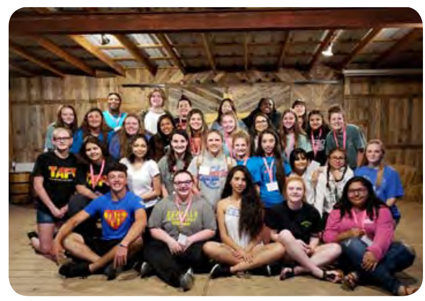
Region & State Officers at the campfire enjoying singing, dancing, s'mores and just getting to spend some time with each other.