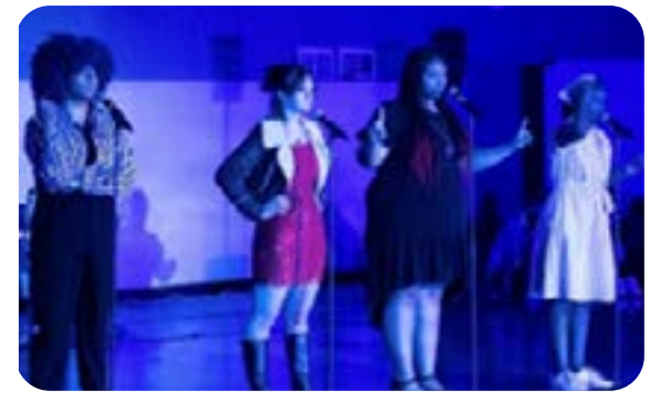
Educational Awareness: NYOS Charter School at their school's Black History Month Program

Service Project: NYOS Charter School is making bags of uniforms in need at their feeder elementary school.