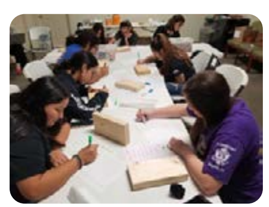
Leadership: Lockhart HS growing and sharing their leadership skills with the junior high officer team.