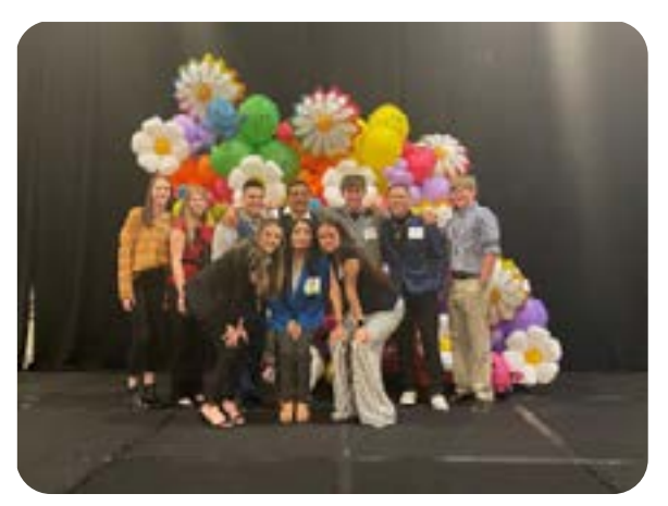
Veribest HS TAFE Chapter enjoying the opening session.