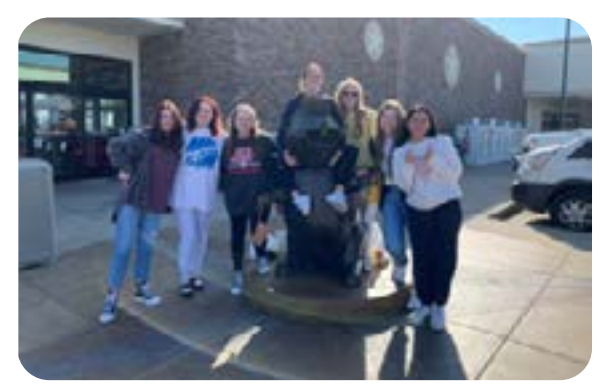
Kingwood HS enjoying a pitstop at Buc-ee's on the way to the 38th Teach Tomorrow Summit.

Over this next year, you are going to make amazing memories! What better way to celebrate these memories than with pictures! In this section of our newsletter, we want to celebrate these great times with you. Send those special pictures from TAFE events to me at <a href="mailto:adrizhere1@gmail.com">adrizhere1@gmail.com</a>