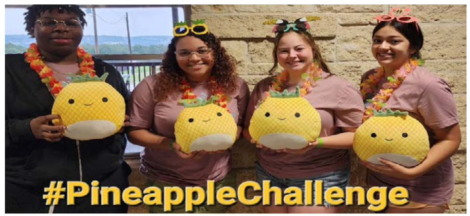
Are you up for the challenge? Visit here for more information!