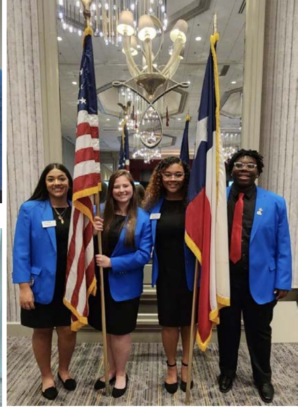
TAFE officer team representing the colors at the FCSTAT Opening Ceremony