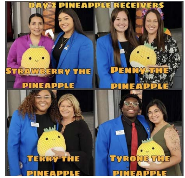
Officers doing the #PineappleChallenge at the Teacher Leader Workshop!