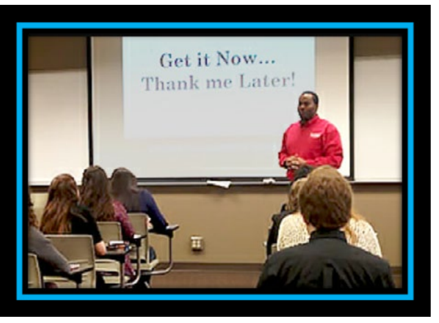
Learning new things is ALWAYS fun. Students are "Getting it Now" in one of many breakout sessions.