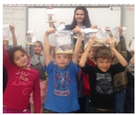
Teaching: Marcus High School TAFE students teach Holiday Lesson making reindeer food.