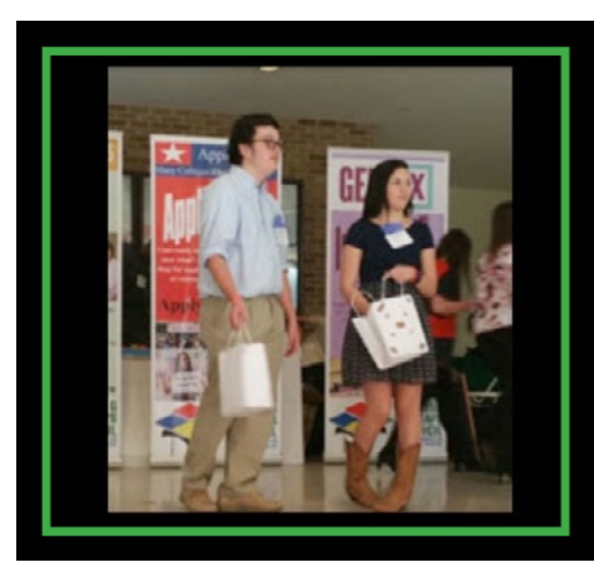
Bring in the Votes!