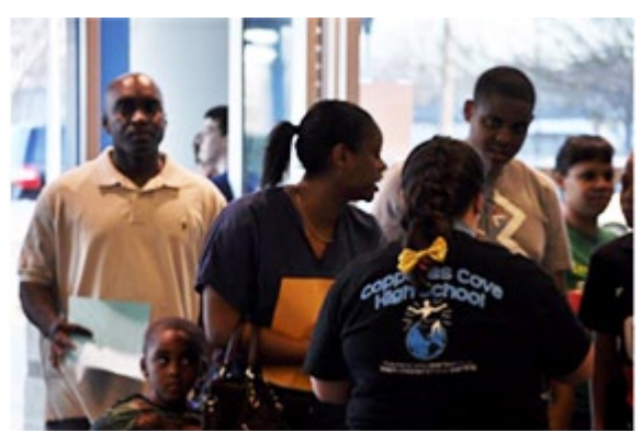
Education Awareness: Copperas Cove High School TAFE members showed incoming freshman around the high school and answered questions they might have had about high school experiences.