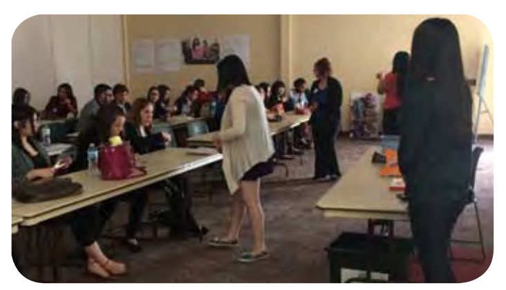
Region 19 Conference breakout session.